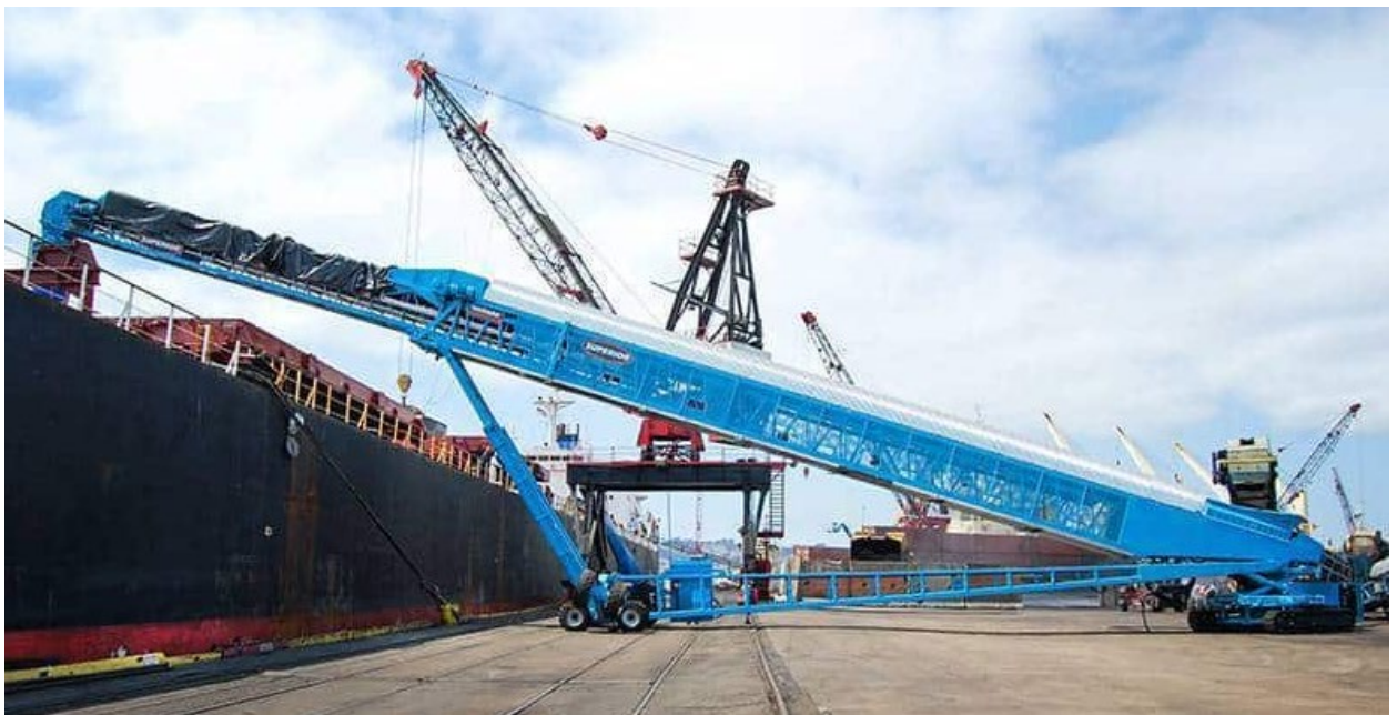
Figure 1 Potential conveyor ore loader