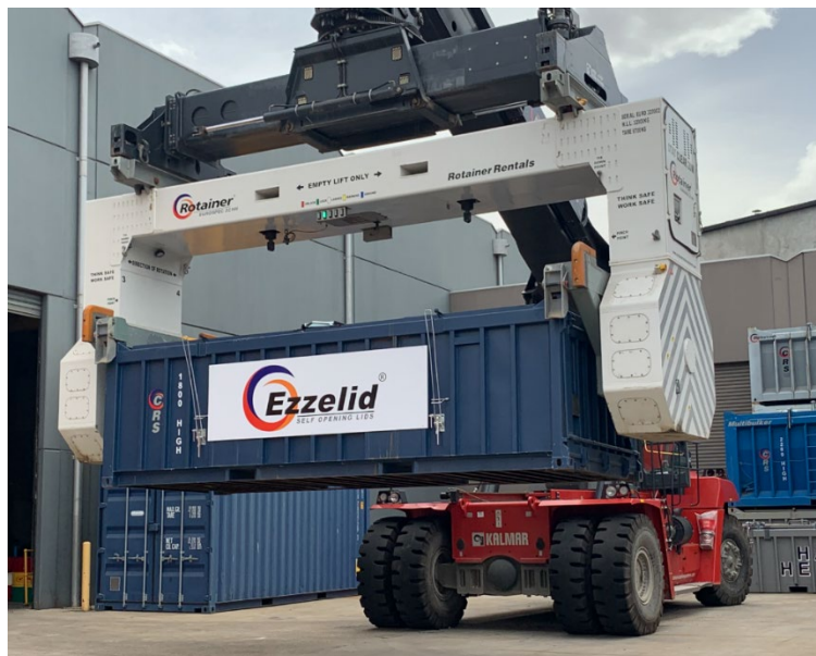
Figure 2 Potential Containerized Bulk Handling system