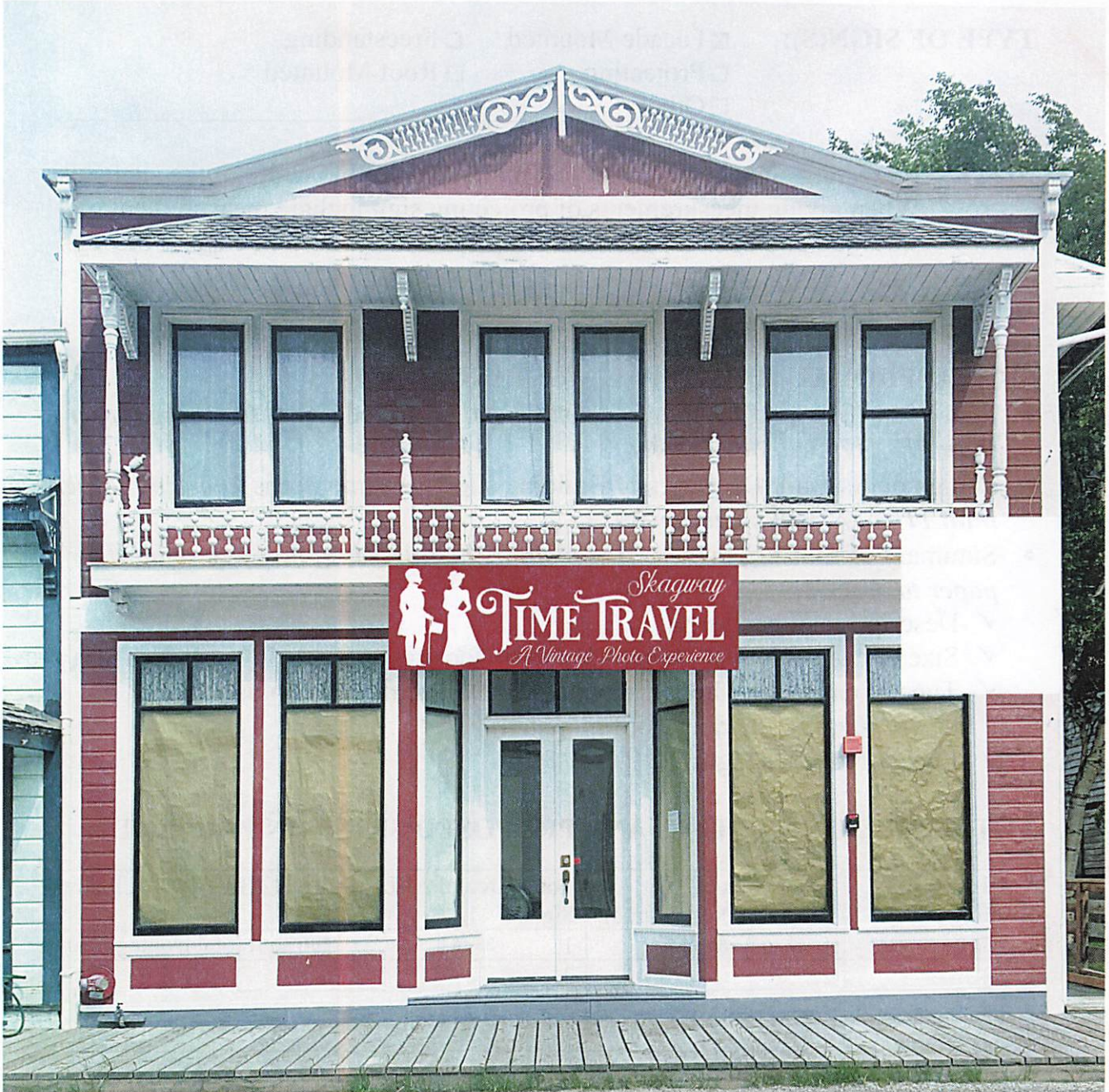
Front sign is 80" wide x 24" tall (approx 13 sq ft) mounted from the balcony over the front door.