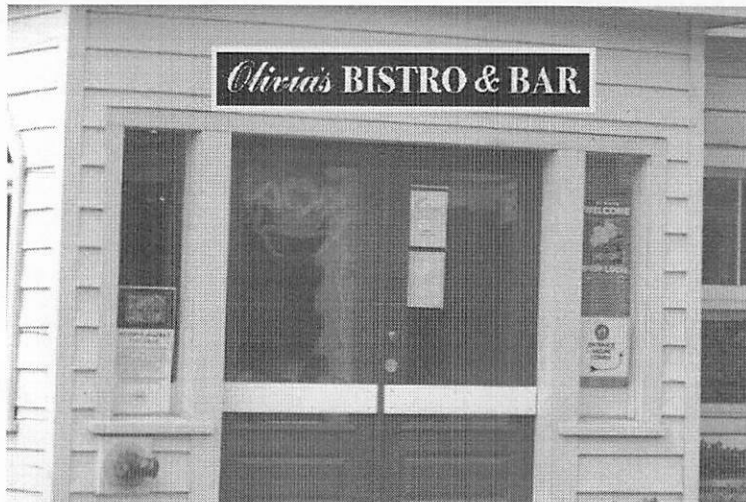
Olivia's Bistro & Bar - View from Broadway