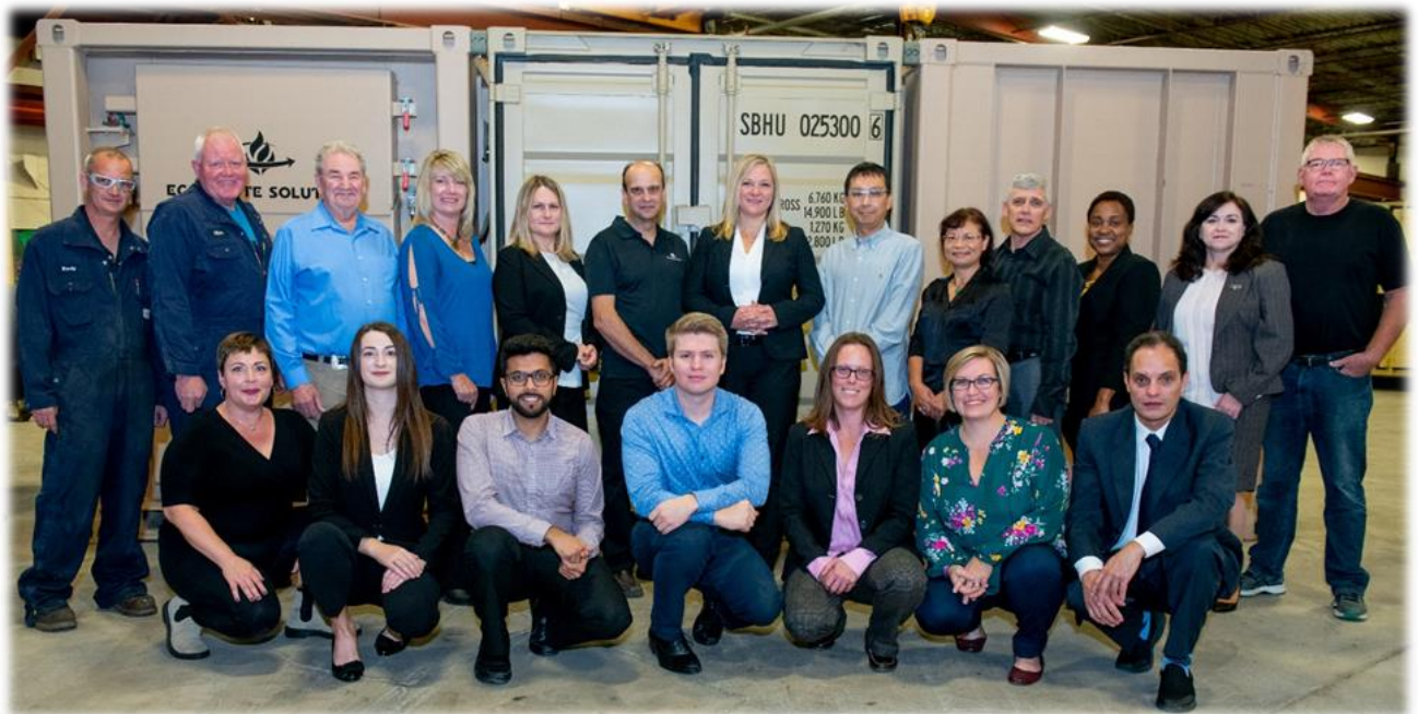
Eco Waste Solutions Team (2018)

There are many companies with waste management experts but there are none that can match Eco Waste's depth in thermal waste conversion technologies. From Engineers with multiple patents and years of experience in waste and waste conversion, to field technicians who can spot a mechanical problem from a mile away and help you resolve it. Eco Waste brings together a diverse group of experts dedicated to solving waste problems.